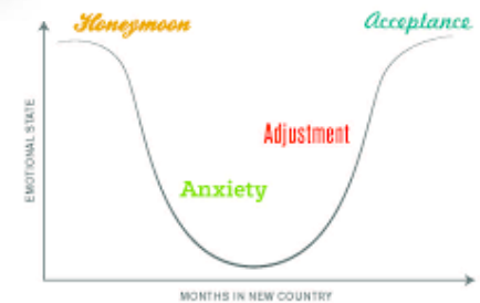
STAGES of CULTURE SHOCK